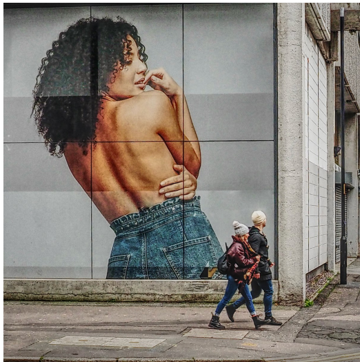
'Looking around' by Bill Salkeld